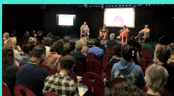
Reveal 14 Conference in Germany

My e-Start joined forces with ten other European Union-funded projects and national initiatives for our final conference to form the REVEAL14 conference. The event was a great success. A total of 110 participants listened to exciting keynotes, visited an interactive exhibition with artefacts from all participating projects and attended stimulating workshops. The event was crowned by a highly acclaimed evening programme, including a storytelling event. We are delighted that we were able to end the project with such a highlight.