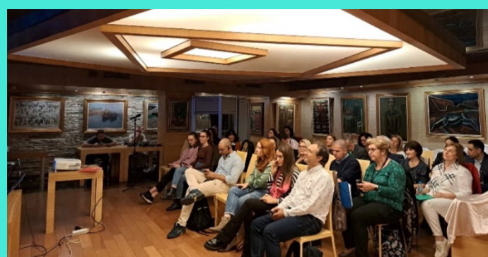
September 28, 2022, Bulgaria

CATRO Bulgaria organised their multiplier event on September 28, 2022, inviting trainers from the largest national VET centre (DBBZ) and the National Employment Agency. More than 20 labour experts and teachers in different fields joined the event. The aim of the event was to familiarise those who had not tested the My e-Start platform with the project aims and results, as well as place these in the larger context and role of education in upskilling underprivileged adults and their digital competencies. The event lasted for more than two hours, including presentations by the CATRO team and the facilitation of a World Café event where the participants had a chance to better get to know each other, and brainstorm some ideas on how they could best utilise the open-educational resources (OER) developed during the project. They talked about the roots of the digital gap issue, why it is important to address it, and how it can be alleviated. The CATRO team made sure to record the outcomes of this activity, and facilitated a great wrap-up discussion in the end of the event.